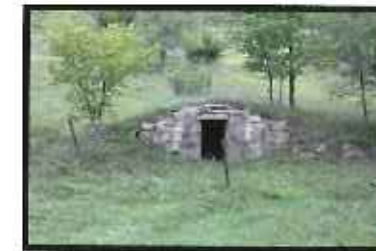
FIRST HOMES – DUGOUTS